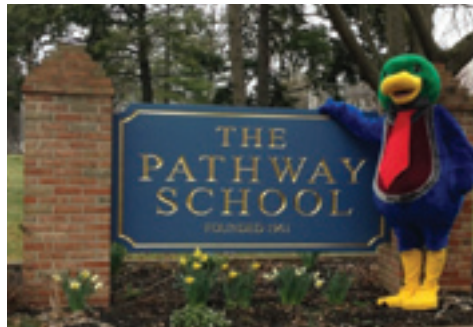
Lewis the Duck at The Pathway School in Jeffersonville, PA.